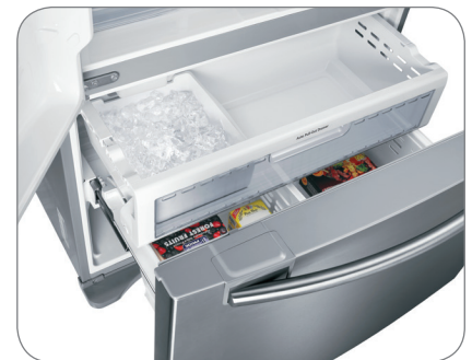
Automatic Filtered Ice Maker in the Freezer