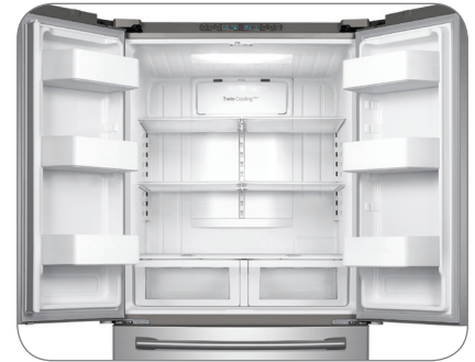
Twin Cooling Plus